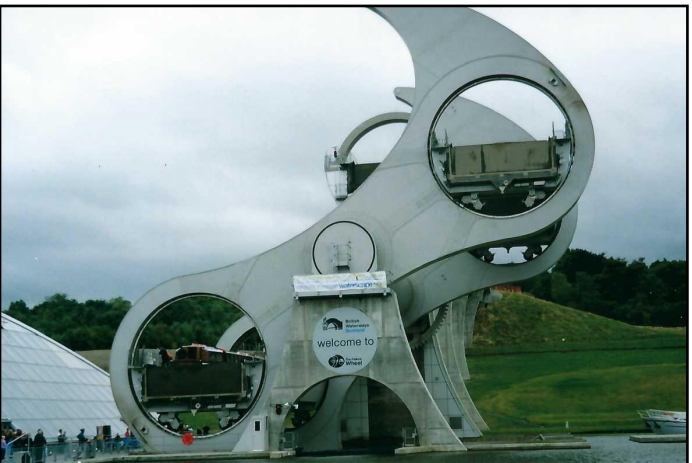
The Falkirk Wheel. See it in motion by clicking: www.scottishcanals.co.uk/falkirk-wheel/about-the-wheel/how

If you have a suggestions for a day trip that the Canal Watch can run, please send an email to barthlinda123@aol.com