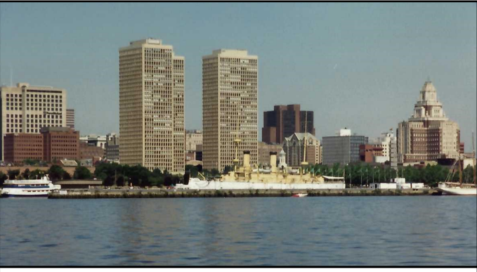
View of Philadelphia during our Delaware River cruise

If you have a suggestions for a day trip that the Canal Watch can run, please send an email to barthlinda123@aol.com