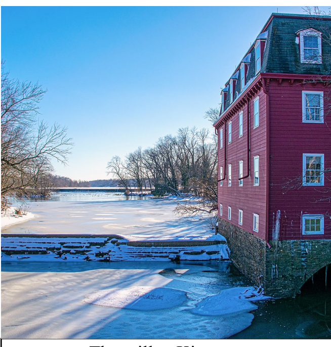
The mill at Kingston