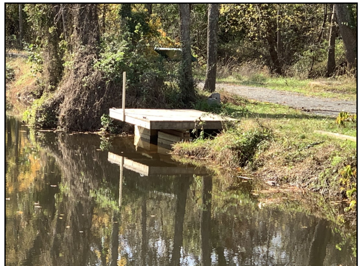
Griggstown dock completed