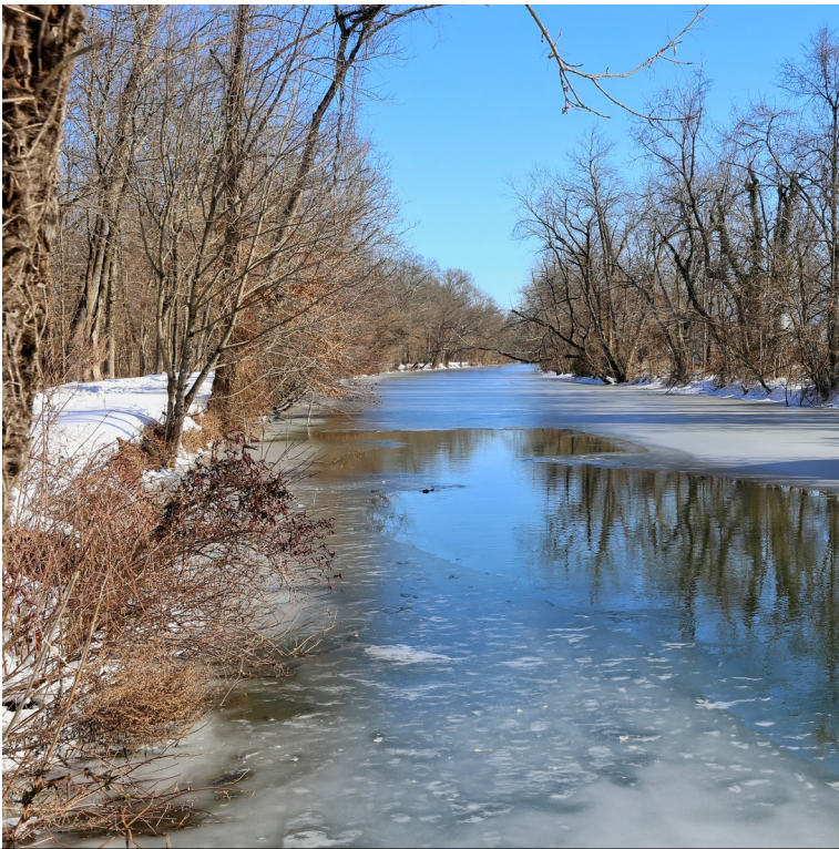
Looking north on the canal from Amwell Road.

The D&R Canal Watch P.O. Box 2 Rocky Hill, New Jersey 08553 908-240-0488 www.canalwatch.org https://www.facebook.com/dandrcanalwatch/ info@canalwatch.org