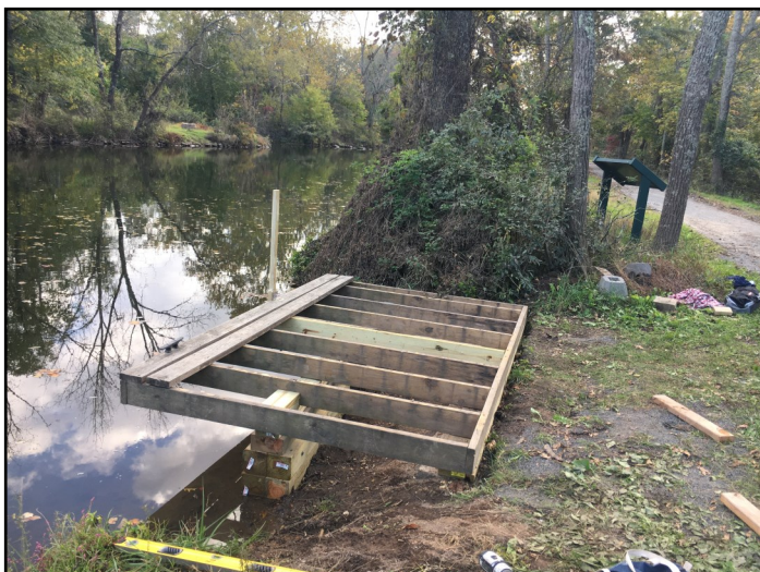
Griggstown dock under reconstruction

The D&R Canal ran 44 miles from Bordentown on the Delaware River to the Raritan River at New Brunswick and an additional 22 miles along its feeder between Bull's Island and Trenton. Except for a small section through Trenton, the rest of the canal is open for walking, running, or biking along its towpath, or paddling through its waters.