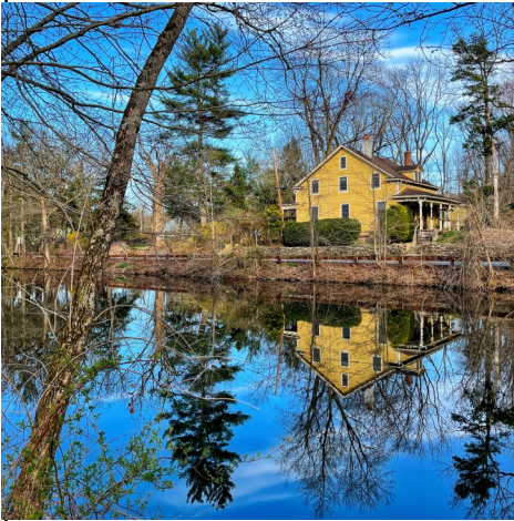
At left: a home along Canal Road in Griggstown, by Summer Pramer.

Here are four examples from previous years: