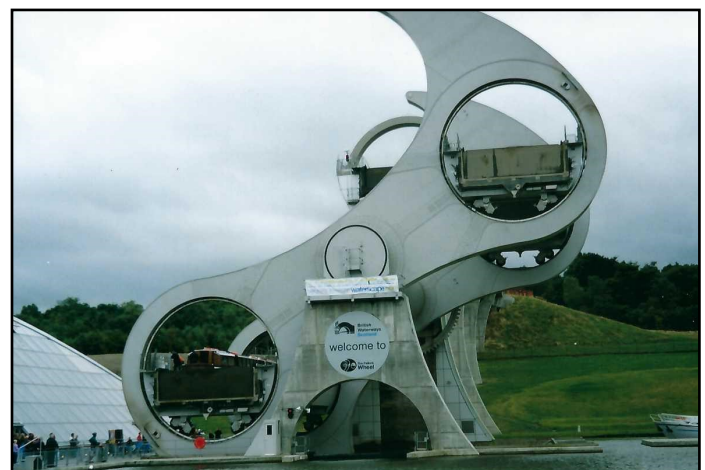
The Falkirk Wheel. See it in motion by clicking: www.scottishcanals.co.uk/falkirk-wheel/about-the-wheel/how

If you have a suggestions for a day trip that the Canal Watch can run, please send an email to barthlinda123@aol.com