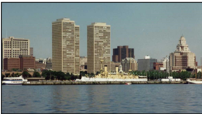
View of Philadelphia during our Delaware River cruise

If you have a suggestions for a day trip that the Canal Watch can run, please send an email to barthlinda123@aol.com